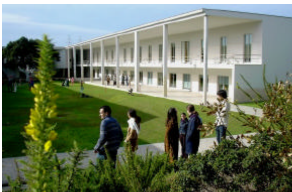
College of Education

This is a document with some useful information about the college where you will be staying during your Erasmus placement.