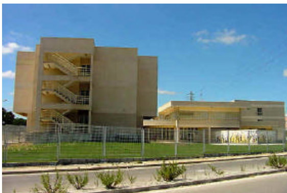
IPS Students Residence

You can stay at our Students Hall of Residence. This is located about 10 minutes walk from the campus. However, it is quite far from the city center. You will have to catch the bus mentioned in the Arrival Information.