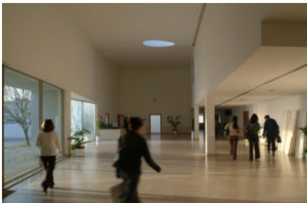
College entrance hall

When you arrive at the College please ask the security guard, who will be at the entrance hall, where the Erasmus Office is located.