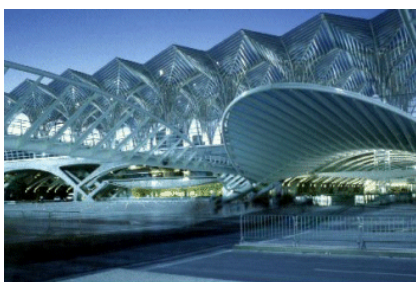
Estação do Oriente

When leaving the airport ( http://www.ana-aeroportos.pt/ANAIngles/Lisboa/HomePage.htm ), please take the bus to “Estação do Oriente”. The Bus Company is “Carris” ( http://www.carris.pt/en/index.php ). You can buy the ticket on the bus.